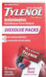
Tylenol® Extra Strength Dissolve Packs, 500 mg. Count: 12