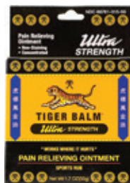
Tiger Balm® Ointment, Ultra Strength, 1.7 oz. Count: 1