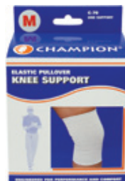
Knee Support, Elastic, Medium Count: 1