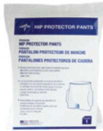
Hip Protector, Medium Count: 1