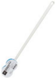
Long Handle Bath Sponge Count: 1