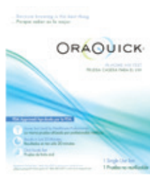
HIV Test † Count: 1