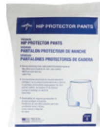
Hip Protector, Large Count: 1