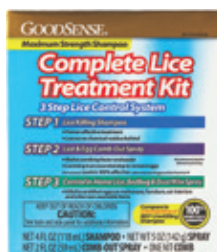
Lice Elimination Kit Count: 1 kit