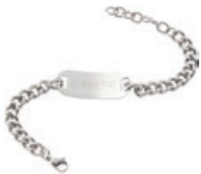
Medical ID Bracelet, Diabetic Count: 1