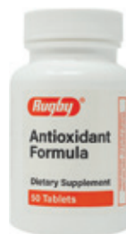
Antioxidant Tablets‡ Count: 50