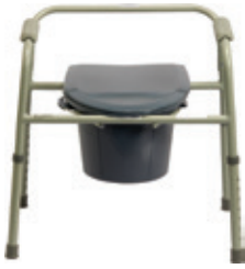
Bedside Commode* Count: 1