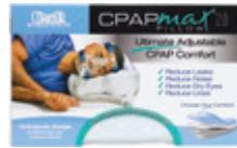
CPAP Pillow Memory Foam Count: 1