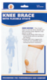
Knee Support, Elastic, Small with Stays Count: 1