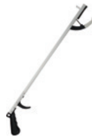
Reaching Aid Device Count: 1