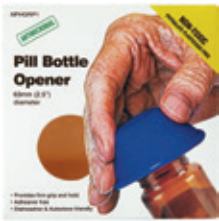
Pill Bottle Opener Aid Count: 1