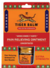
Tiger Balm® Ointment, Extra Strength, 0.63 oz. Count: 1