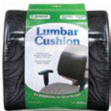
Cushion, Lumbar Count: 1