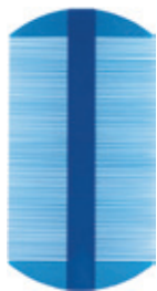
Lice Comb Count: 1