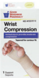
Wrist Compression, Large Count: 1