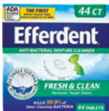
Efferdent® Plus Mint Tablets Count: 44