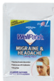
Wellpatch® Migraine Count: 4