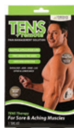
Tens Unit, Digital Count: 1