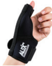
Thumb Brace Count: 1