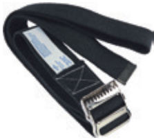
Gait Belt, 72" Count: 1