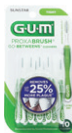
Interdental Gum Brushes Count: 10