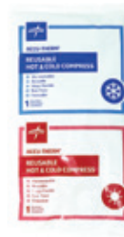
Hot Cold Reusable Pack, 5" x 10" Count: 1