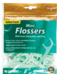
Interdental Flossers Count: 90