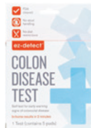
EZ Detect™ Colon Cancer Test Kit † Count: 1