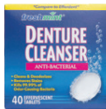
Denture Cleaning Tablets Count: 40