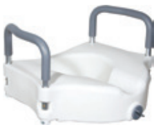
Raised Toilet Seat with Arms Count: 1