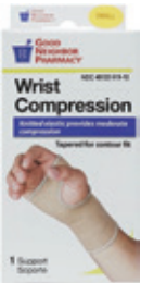
Wrist Compression, Small Count: 1