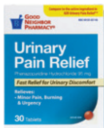
Urinary Pain Relief, 95 mg. Count: 30