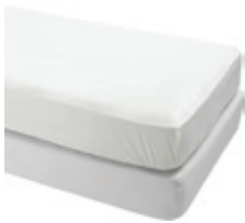
Elastic Mattress Cover, 80" x 36" x 6" Count: 1