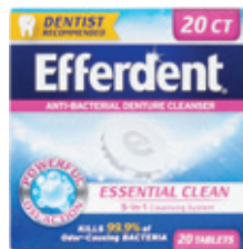
Efferdent® Tablets Count: 20