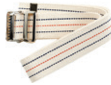
Gait Belt, 60" Count: 1