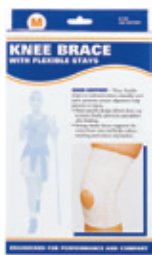
Knee Support, Elastic, Medium with Stays Count: 1