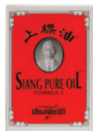
Siang Pure Oil Original Red Formula, 7 ml. Count: 1