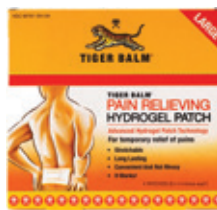
Tiger Balm® Patch, Large Count: 4