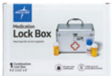
Medication Lock Box Count: 1