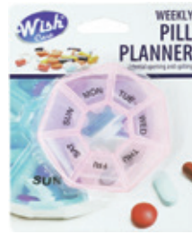
Pill Box, 7 Day, 1 Time a Day Count: 1