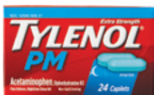
Tylenol® PM Extra Strength Tablets, 500 mg. Count: 24