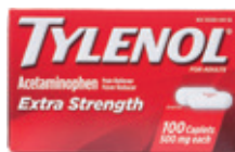
Tylenol® Extra Strength Tablets, 500 mg. Count: 100