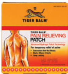
Tiger Balm® Patch, Regular Count: 5