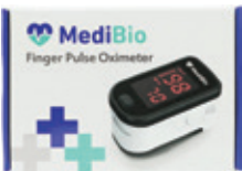
Pulse Oximeter † Count: 1