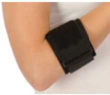
Tennis Elbow Support Count: 1