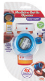
Medicine Bottle Opener with Magnifier Count: 1