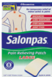
Salonpas® Patch Count: 6