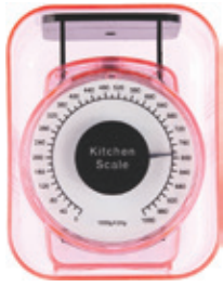
Kitchen Scale, Dial † Count: 1