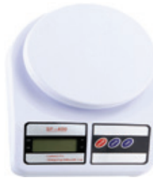
Kitchen Scale, Digital † Count: 1