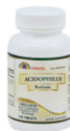
Acidophilus Probiotics, 500 mm.‡ Count: 100