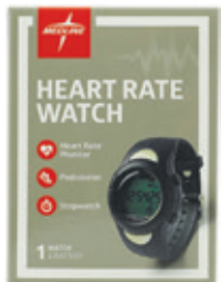
Heart Rate Monitor Watch † Count: 1