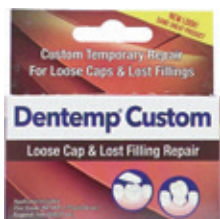
Loose Cap and Filling Repair Count: 1