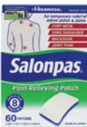
Salonpas® Patch, Small Count: 60