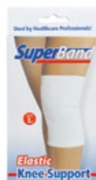
Knee Support, Elastic, Large Count: 1