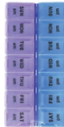
Pill Box, 7 Day, AM & PM Count: 1