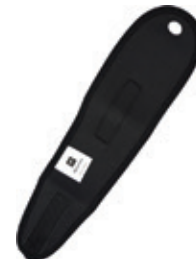
Wrist Support Count: 1