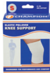
Knee Support, Elastic, Small Count: 1