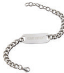
Medical ID Bracelet, Heart Count: 1