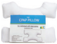
CPAP Pillow Fiber Filled Count: 1