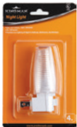
Night Light Count: 1