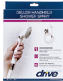
Handheld Shower Head Count: 1