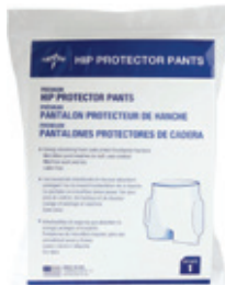
Hip Protector, X-Large Count: 1