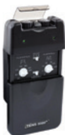
Tens Unit, Analog Count: 1