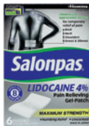
Salonpas® Patch, Lidocaine, 4% Count: 6