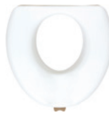
Raised Toilet Seat, Locking Count: 1